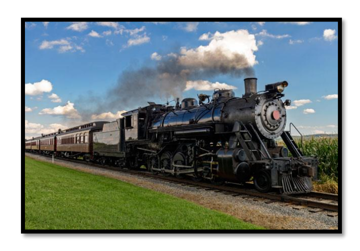
Spring Tour Saturday, May 27, 2017 Mid-Continent Railway Museum Baraboo, WI.