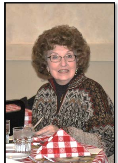
48 th Anniversary Dinner